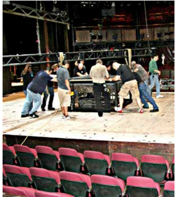
Setting the Trap Machinery for Tonight.