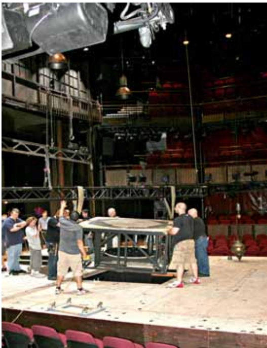
Pulling the Trap Machinery from Last Night.