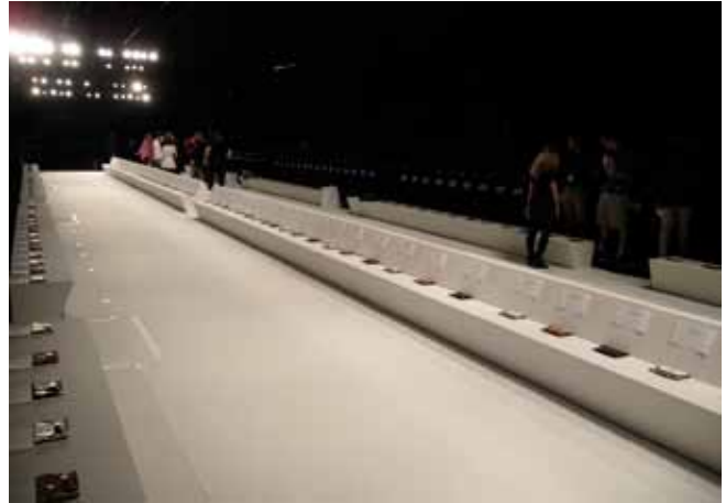
The runway and benches for the main Fashion Show.