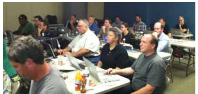
Local One Brothers and Sisters listening attentively during the SMAART Training Class