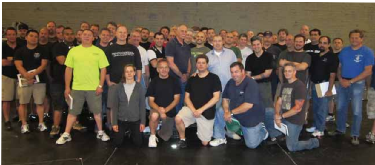
The Class of 2012 --36 of These Members are now ETCP Certified Theatrical Riggers