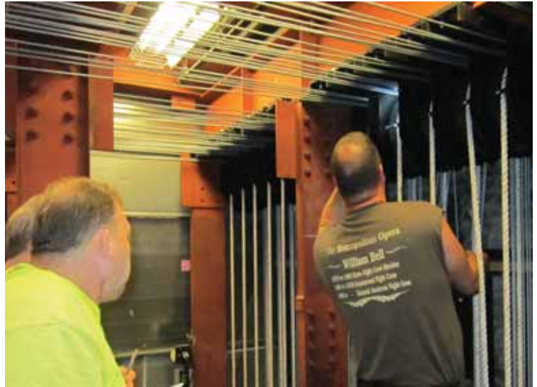
Then Head Blocks and the Head Beam

for the Entertainment Technician. This course includes sections on power distribution, digital control protocols and safety procedures. This course will be followed by a pencil and paper exam for ETCP Entertainment Electrician certification. We have 25 members registered to take this exam for the first time and four who are retaking the course and test.