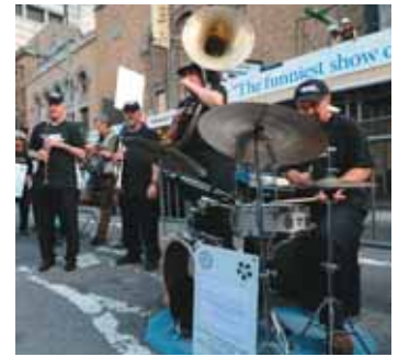
Musicians Local 802 Played Some Picket-Line Walking Jazz