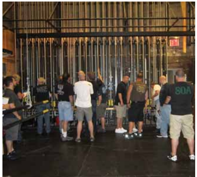
Rigging System Inspection