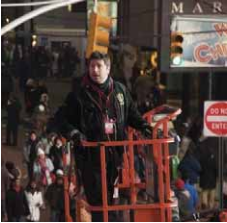
From A Genie In Times Square ...