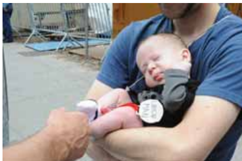
OUR FAMILIES AND THEIR FUTURE