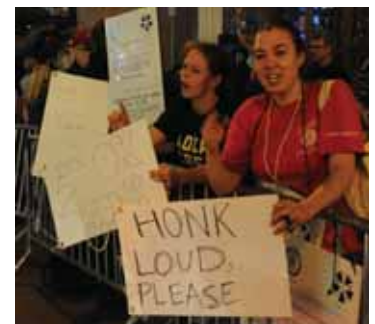
Some Of Local One's Sisters and The Theatrical Teamsters' Custom Semi Truck Turned New York City Traffic On 45th Street Into Our Allies In This Fight