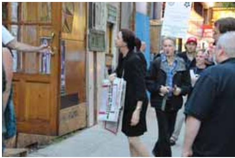
AGVA Representative Confronts the Producers