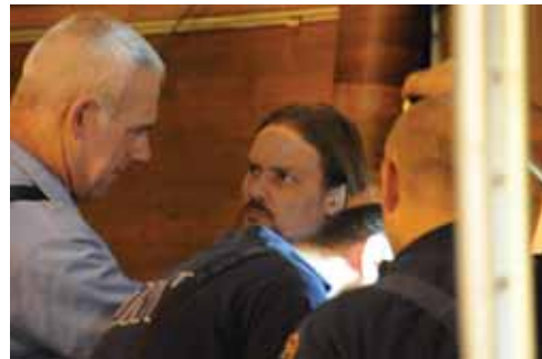
As The Producer Is Finding Out Here.