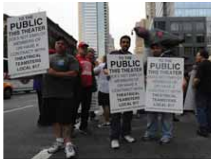
Theatrical Teamsters Local 817 Have Our Back With Their Rat On Eighth Avenue