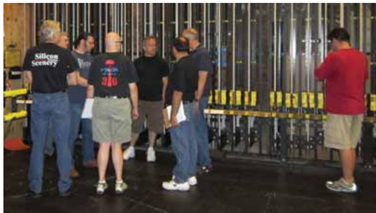
Next the Idler Wheels and Hauling Lines