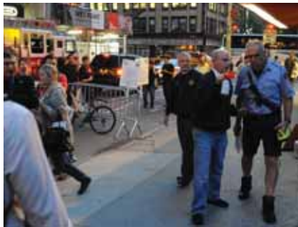
With The Fire Department Of New York