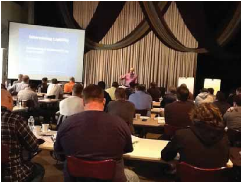
It Starts in the Classroom