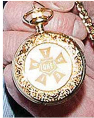
The 60 Year Watch