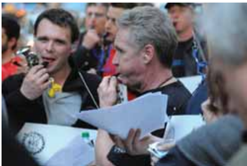
With Whistles and Ear Plugs,