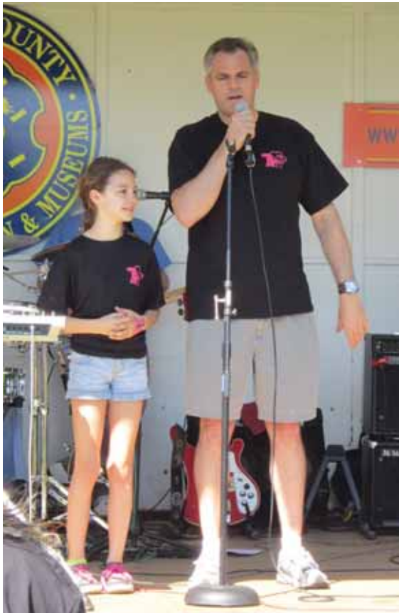
Raising Money and Awareness at Long Island Liver Walk