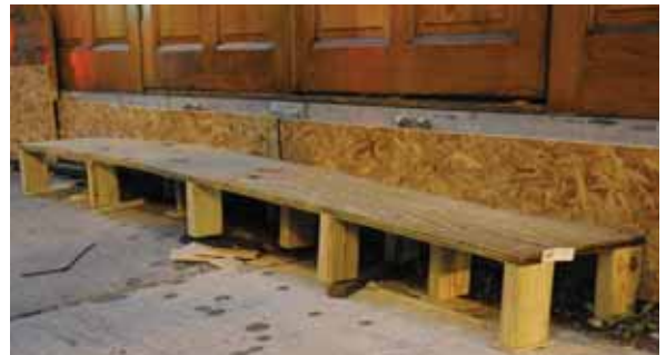
PUBLIC SAFETY: This Step Was The Main Entrance For The Audience