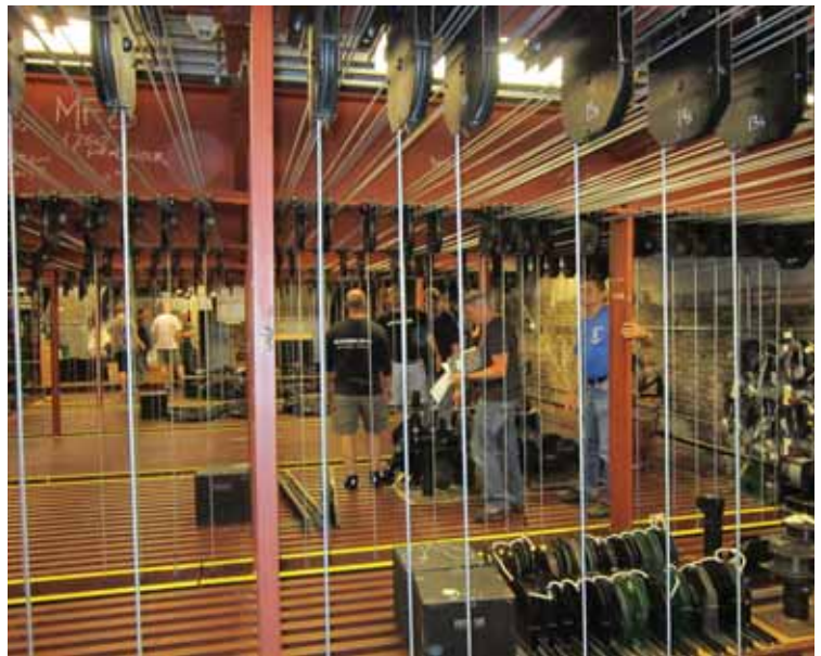
Finally, The Grid Iron

We're moving forward with this drive to have as many of our members as possible ETCP certified. To that end I would like to propose that part of the 2013 budget is set aside for ETCP prep classes in Theatre and Arena Rigging And Entertainment Electrical.