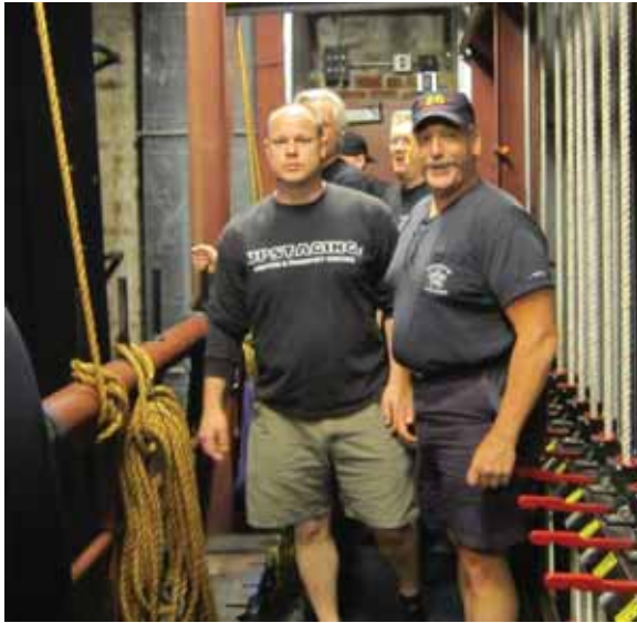
On to the Line Locks and Pin Rail