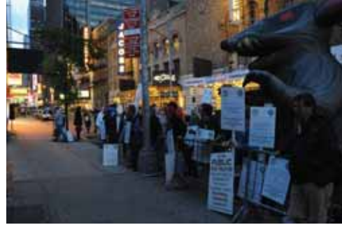
... And We Fought By Night