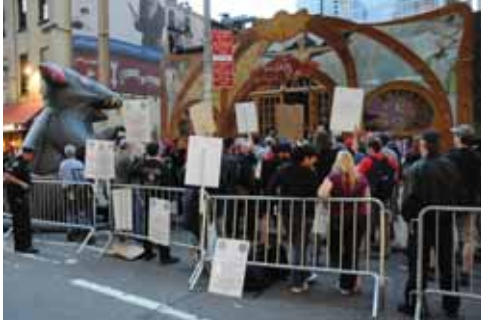
We Fought By Day ...