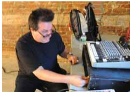
With Electronic Jack Hammer Sound Effects