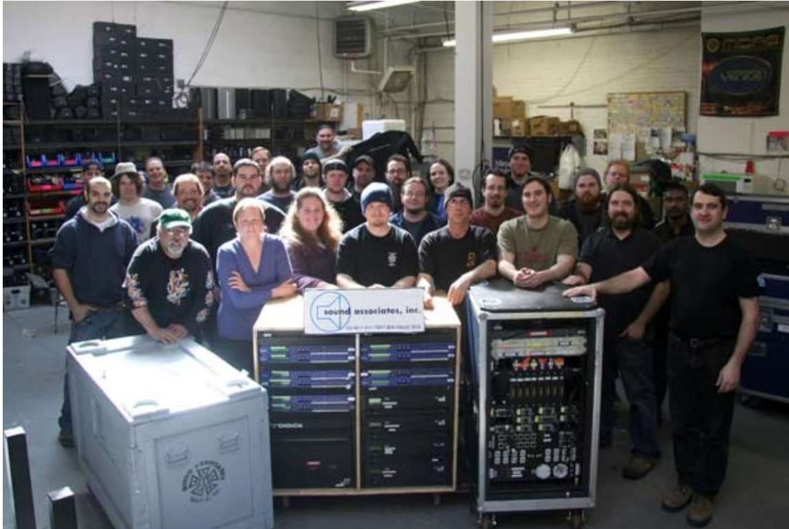
The Sound Associates Crew at the Yonkers, NY shop