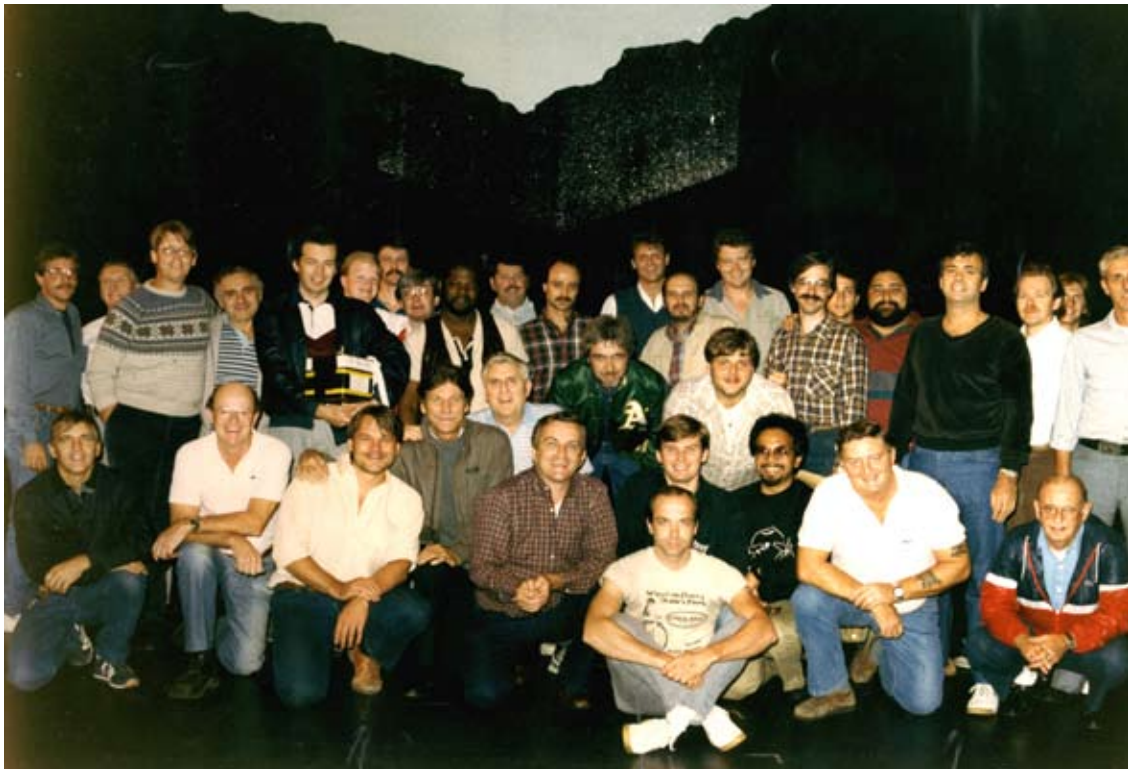
Singin' In The Rain stage crew, George Gershwin Theatre, circa 1985. When we were young.