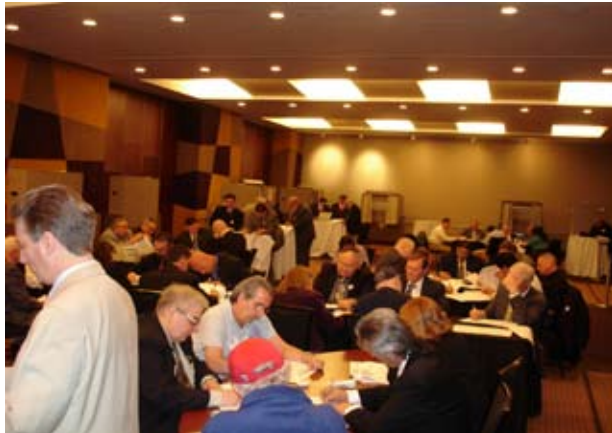
After the closing of the polls, the Election Committee tabulated the results.